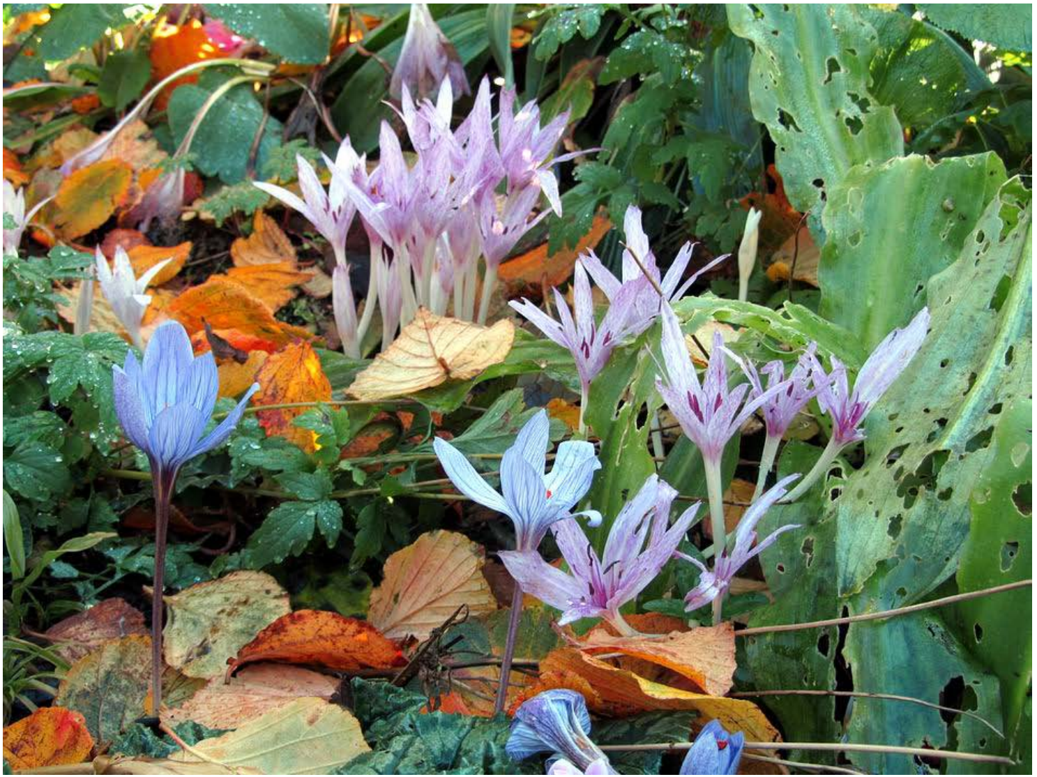
I accept the slug chewed leaves as a fact of life and I think, due to the cool moist summer, many of us have suffered more than most years from the massive explosion in the population of slugs and snails.

The hot colours of fallen Hamamelis leaves provide the perfect contrast and background to the tessellated flowers of Colchicum agrippinum.