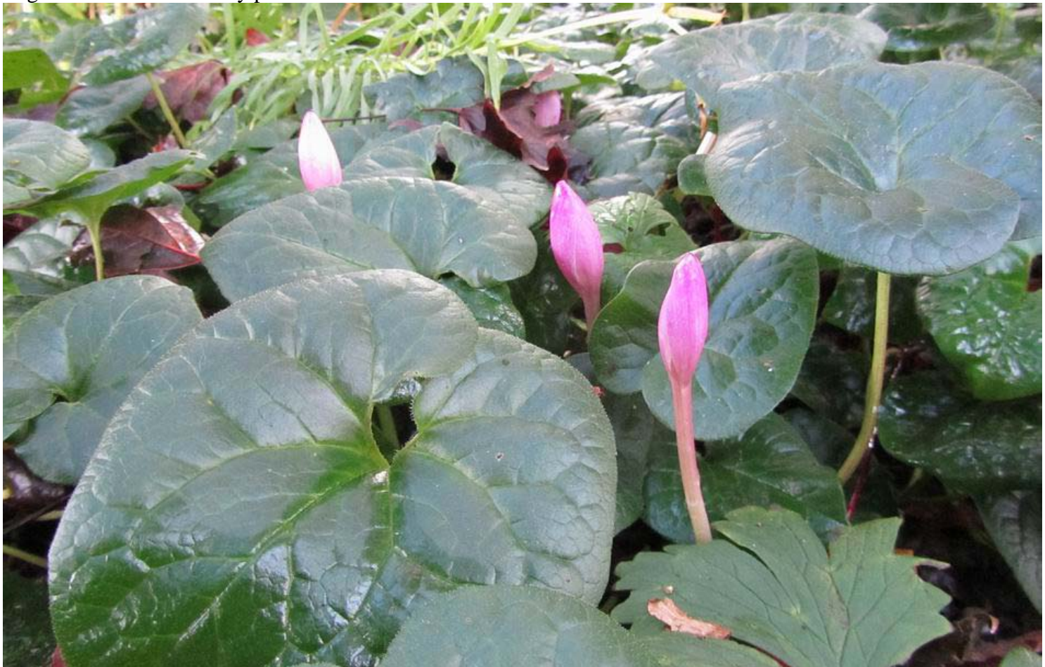
Also in deep shade more Colchicum flowers push their way through the leaves of a sprawling Asarum.