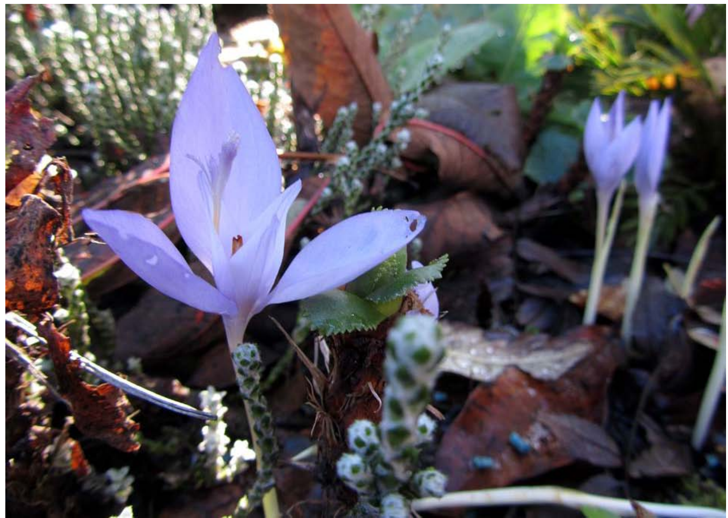
Crocus banaticus slowly clumps up in our garden while Crocus vallicola below remains as a single corm and if I want a group I have to raise them from seed and plant them together.