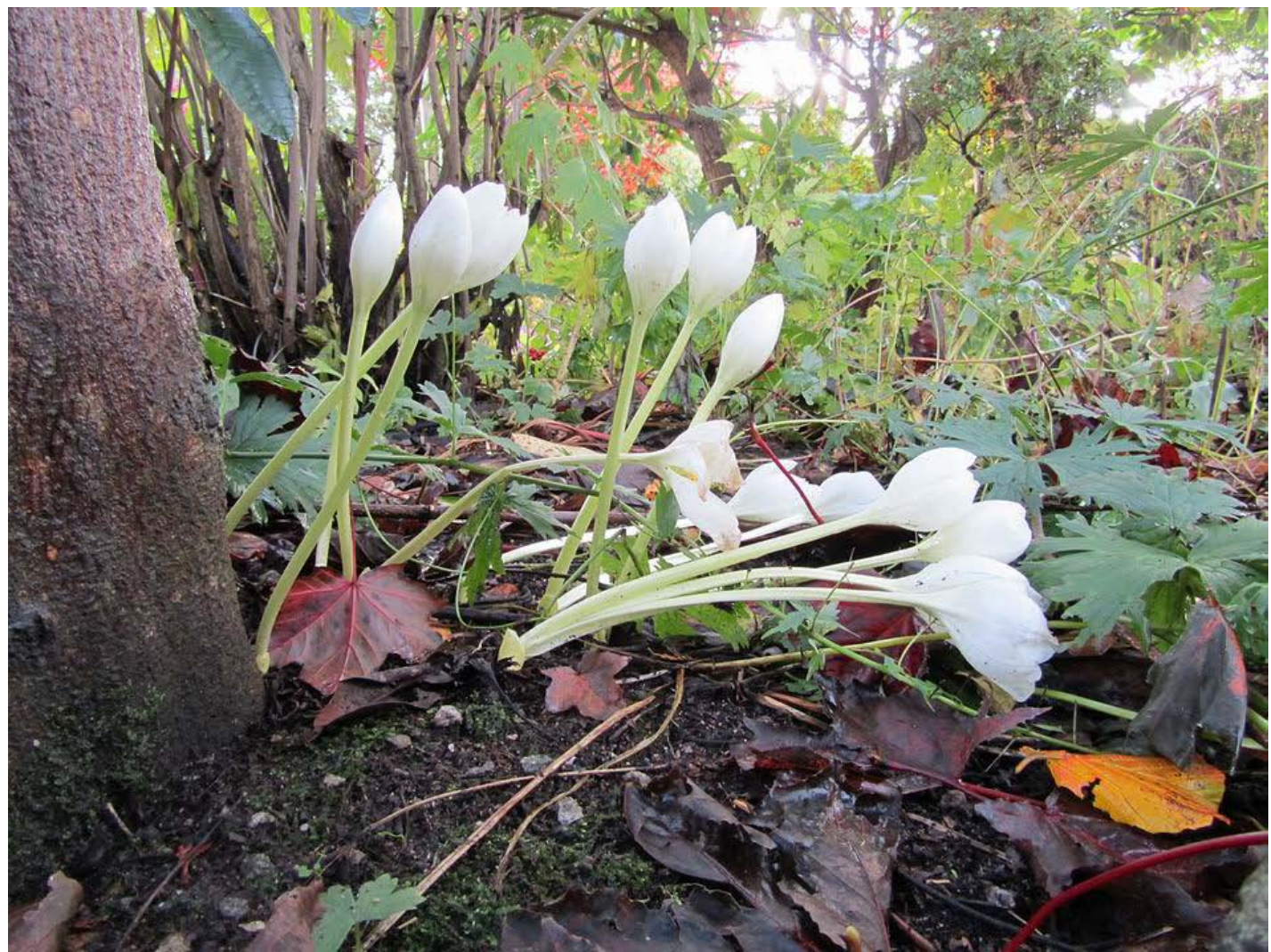
Moving around the garden, Colchicum speciosum album flowers in the deep shade planted right at the base of a large Acer where not many plants would thrive.