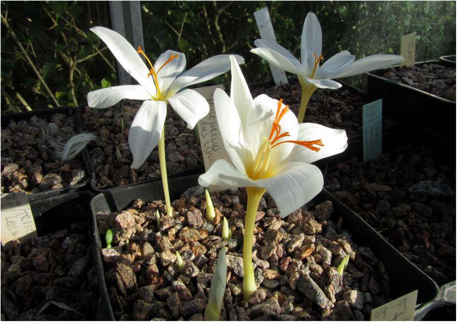
With so many species close together open pollination will result in hybrids like this white one above. While I had it labelled as Crocus pulchellus albus I suspect that it is not the true species.