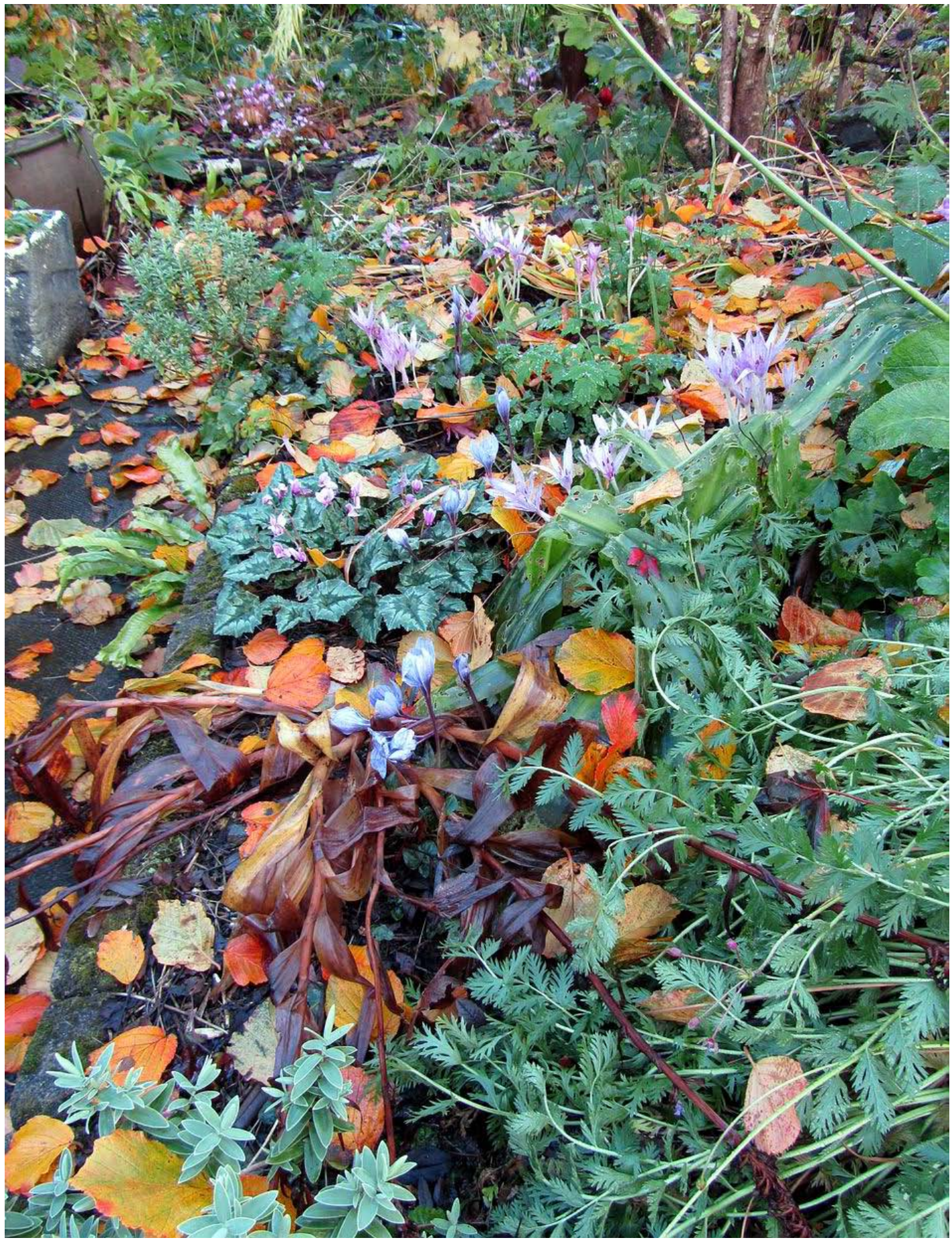
Autumn colour bulb bed