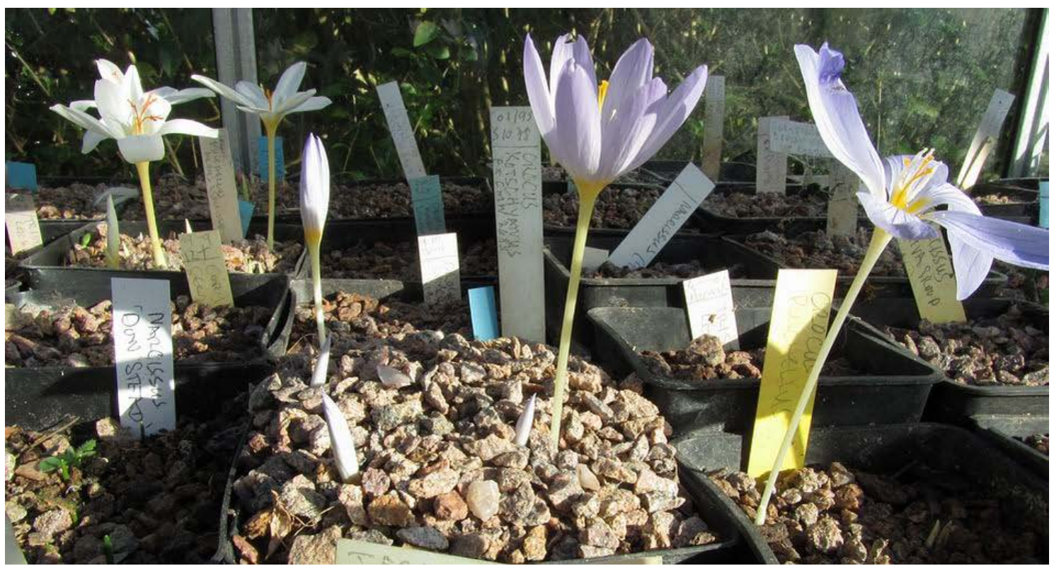
Crocus in the Bulb House

Moving on into the bulb houses more Crocus are now appearing - encouraged to open their flowers by the mild conditions we enjoy occasionally when the wind comes from the south, pushing the warm air up from Africa.